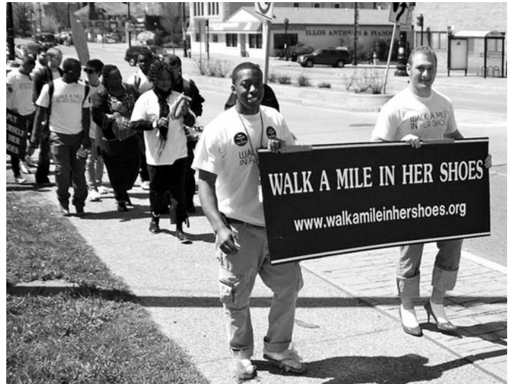
Walk A Mile 2011