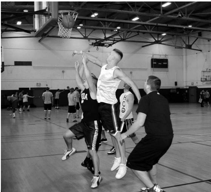
"UB Men's Group 3 on 3 Hoops Tournament, Jan. 28, 2012"

On January 28, the UB Men's Group put on a 3 on 3 Basketball Tournament called "Hoops for Hope 2012" that raised over $700 for the Advocate Program at Crisis Services. This is the same group that has sponsored "Walk A Mile in Her Shoes" for the past several years, always raising money and awareness for the issue of Sexual Violence. Walk A Mile 2012 will take place on April 28th beginning here at Crisis Services.